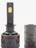
LB-7555, 150W (LB-002B)

5080 12 core 55MIL, Startup: 100W Stable 85W, 8500LM/pc, 6000K-6500K, DC9~32V