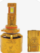
LB-10085, 200W (LB-001B)

Sanan4575*6*75MIL, Start: 75W Change with APP, 6500LM, 6500K/4500K/3000K, DC9~30V