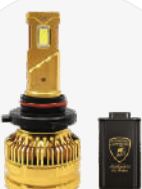
LB-6550, 130W (LB-001D)

3780 6 core 55MIL, Startup: 75W Stable 55W, 6500LM/pc, 6000K-6500K, DC9~32V