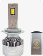
LB-7555, 150W (APP CONTROL) (LB-001A)

Sanan4575*6*75MIL, Start: 75W Change with APP, 6500LM, 6500K/4500K/3000K, DC9~30V